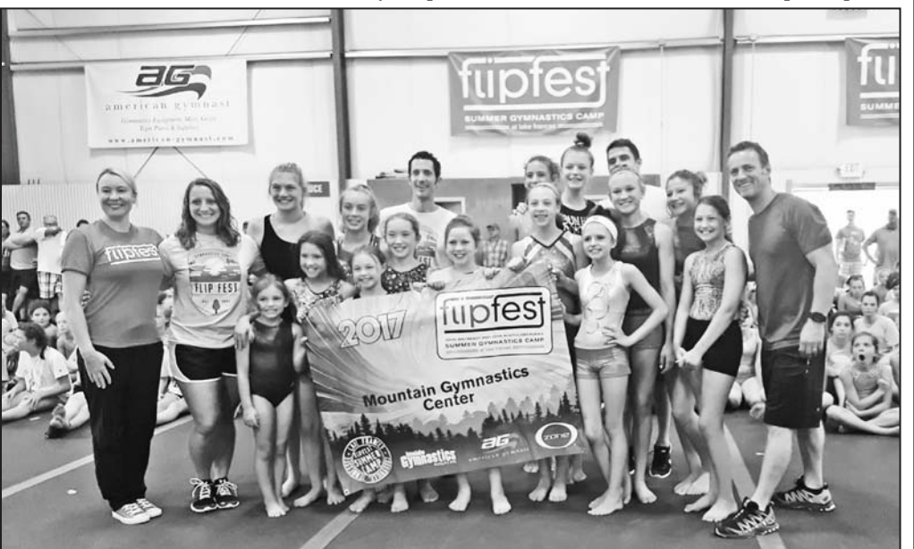
Mountain Gymnastics Center participated in FlipFest 2017 - a summer gymnastics camp.